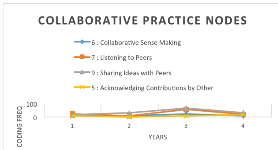
Figure 2: Summary of heavily coded nodes categorized by collaborative practice for all students by years.

Collaborative problem-solving practices. There were four heavily coded nodes for student collaborative work practices that emerged from the analyses (see Figure 2), three of which are aligned with discourse practices (e.g., Manouchehri & St. John, 2006): collaborative sense making , listening to peers , and sharing ideas .